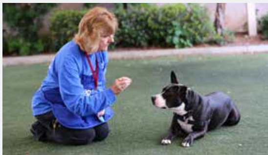
Doni & Rocky

allowing us to share these lifesaving practices with organizations nationwide.